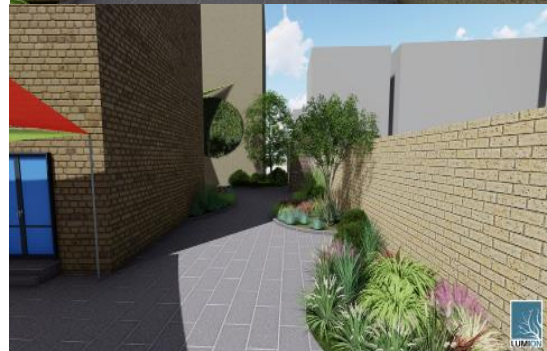
Main Event Space- Visual